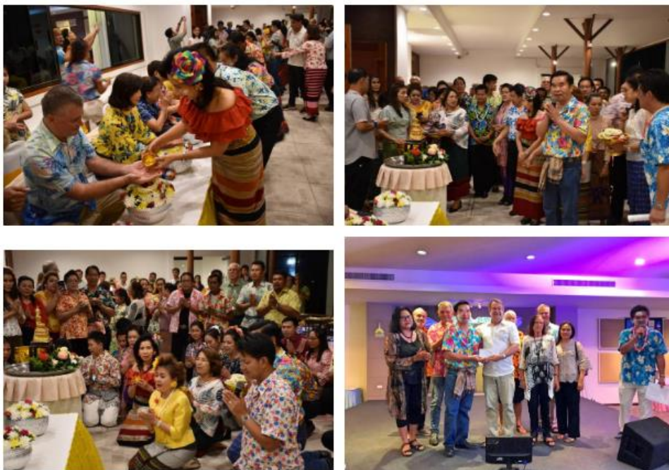
Photos of RC Hua Hin Songkhran Night.