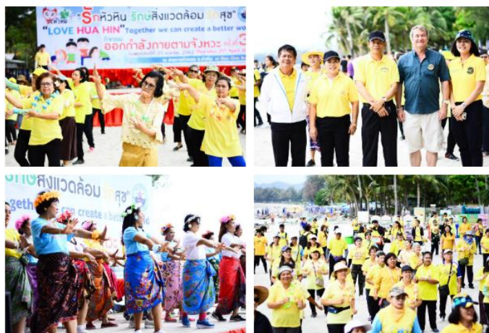
Photos from Love Hua Hin Community Day.