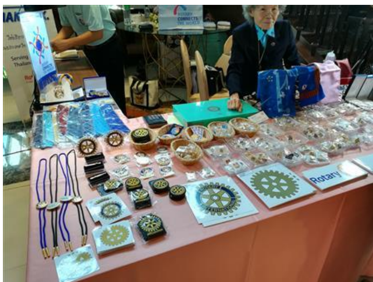
Items for Sale at Official RC functions.